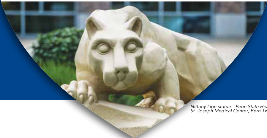
Nittany Lion statue - Penn State Health St. Joseph Medical Center, Bern Twp.